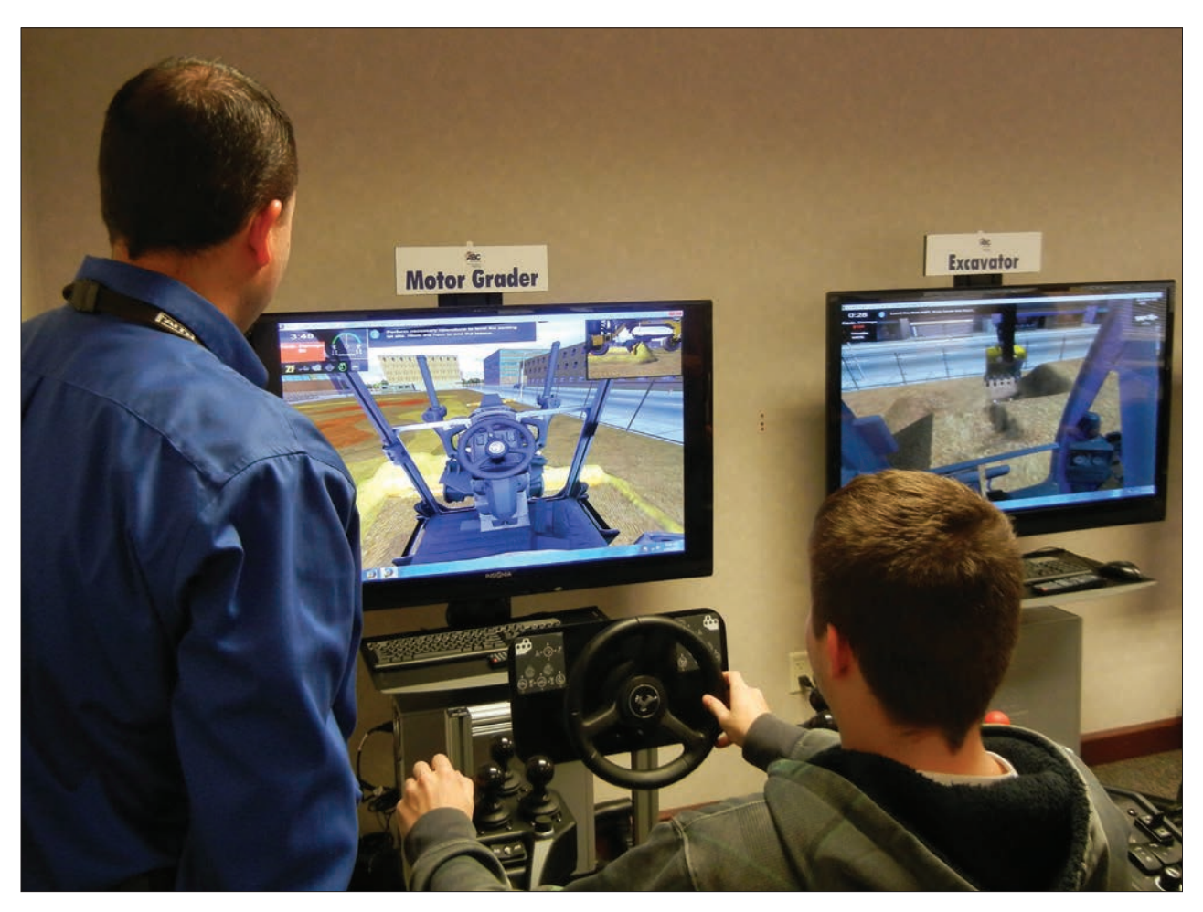
First-person controls provide an operating environment similiar to gaming platforms.